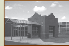
Prescott 1090 Commerce Dr.