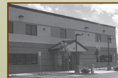
Prescott Valley 3212 N. Windsong