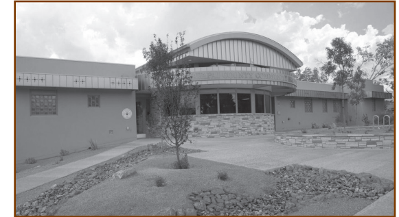
The new Cottonwood Community Health Center.

As if that wasn't enough, just down the hall is our new dental wing. The spacious surroundings, comfortable dental chairs, and well trained staff who pay incredible attention to detail and service, is all part of making your visit to the dentist as enjoyable as a visit to the dentist can be.