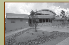
Cottonwood 51 Brian Mickelsen Parkway